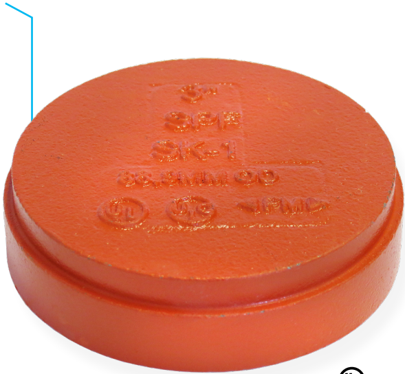
Cap Fig. SK-1